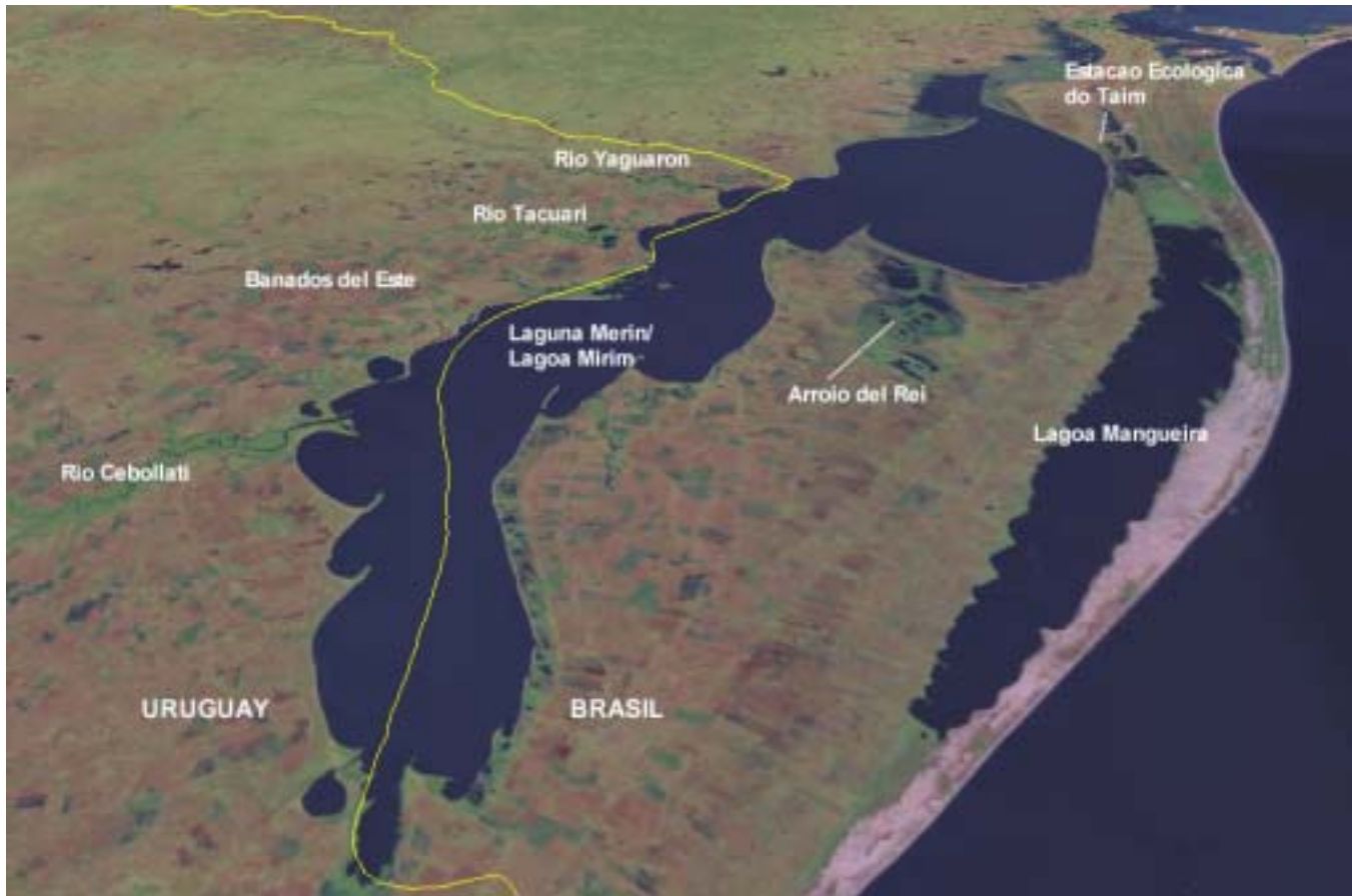
In this oblique image, looking from the south of Laguna Merin towards the north, the location of the Brazil-Uruguay border is approximate; it floats about 1 km above the image. This image was captured from NASA's WorldWind data visualization tool.

Laguna Merín (Lagoa Mirim in Portuguese) is a large freshwater lake on the border between Brazil and Uruguay. It is the second largest lake in South America after Lake Titicaca in the Andes. The lake and the surrounding wetland complexes play host to a wide array of waterfowl as well as other flora and fauna of international importance.