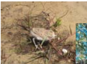
From left to right: Collared Plover chick ( Charadrius collaris ), Great Horned Owl ( Bubo virginianus ), Carnations of the Air ( Tillandsia aeranthis ), Hilaire's Side-necked Turtle ( Phrynops hilarii )

The pilot project also sought to test the utility of the Diversidad software package, which utilizes the diversity of pixels in an the image as a proxy for biodiversity richness. The preliminary results suggest a reasonably high correlation between pixel diversity and bird species richness for the October survey ( R^2 of .20, P < .10 ).