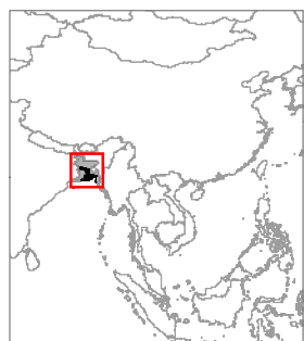
Population Density within and outside of a 5 meter low elevation coastal zone (LE CZ), 2000