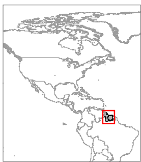
Population Density within and outside of a 10 meter low elevation coastal zone (LECZ), 2000