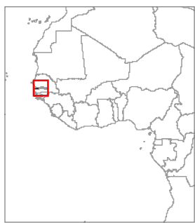
Population Density within and outside of a 10 meter low elevation coastal zone (LECZ), 2000